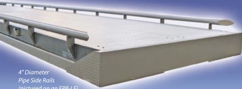
4" Diameter Pipe Side Rails (pictured on an EPR-LF)

The PRC series incorporates Cardinal's model SCA all-stainless steel, environmentally sealed, compression load cell designed to ISO guidelines and NIST specifications for extreme accuracy. The SCA load cell is designed for rugged day-to-day use in heavy capacity applications. The PRC scale includes a movement restraint system to protect key components from damage while providing the accuracy you require.