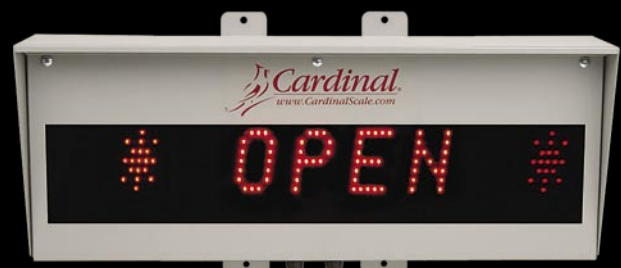
Variable message sign with warning.