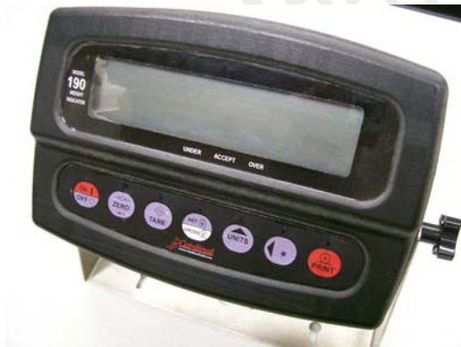
Model 190 (front)