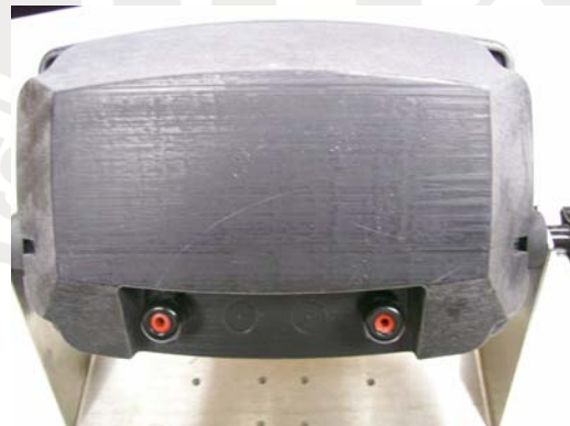
Model 190 (rear)